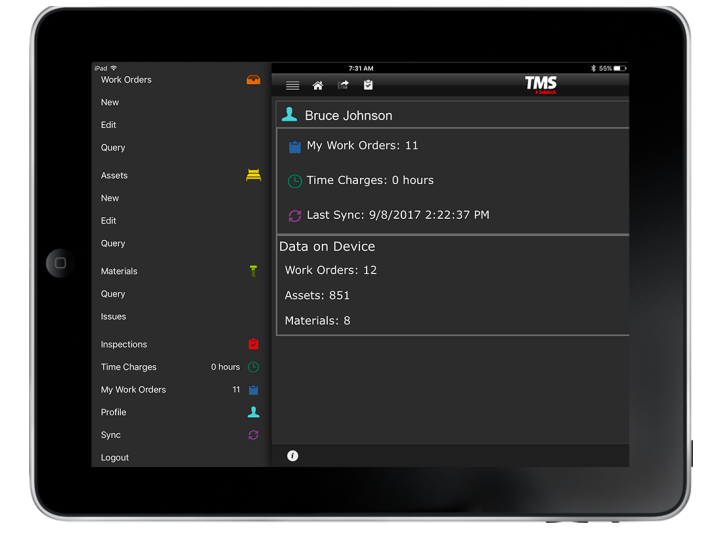
TMS Sidekick Mobile App

With easy-to-use drop downs, technicians can quickly select responses and minimize data entry errors. Capture and update information in the field, quickly and effortlessly.