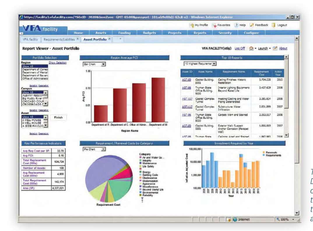
The Portfolio Summary Dashboard provides an overview of assets across the entire portfolio, including their relative conditions and overall requirements.

Documents and links to other sites and data sources can be associated site-wide, or attached to objects including regions, assets, and requirements. Examples include policy and procedure documents, maintenance schedules, approved budgets and facility-specific reports.